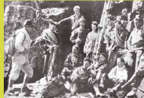
Keswick Mountain Rescue 1947