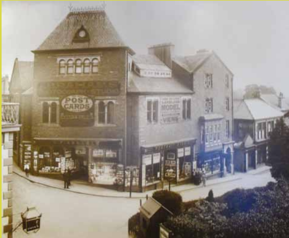
Abraham's Photographic Shop